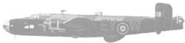
.....Salvage Halifax Foundation 1944

We recently received word from our friends with the Salvage Halifax Foundation that they have successfully completed salvage of a Halifax MK III bomber that was shot down by a German fighter in May 1944. All