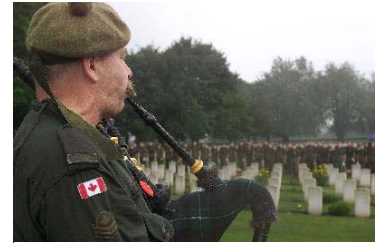
Remembrance Ceremonies at Groesbeek Canadian War Cemetery near Nijmegen, The Netherlands in 2001.

Look up, and swear by the green of the spring that you'll never forget.